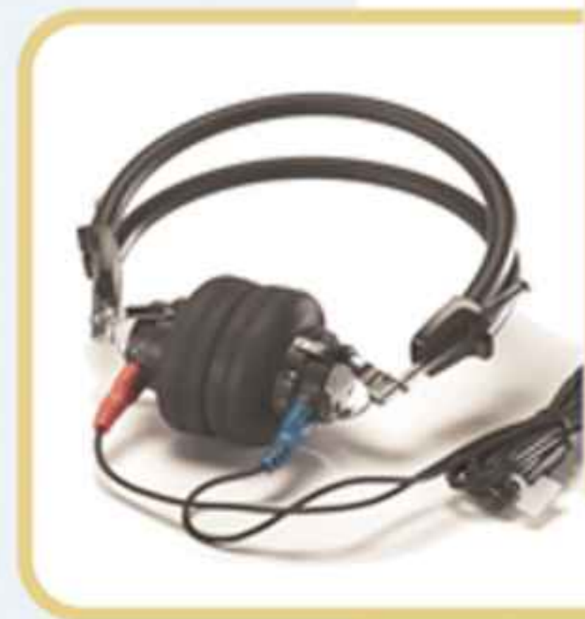
Choice of transducers (TDH-39, Sennheiser, EAR 5A)