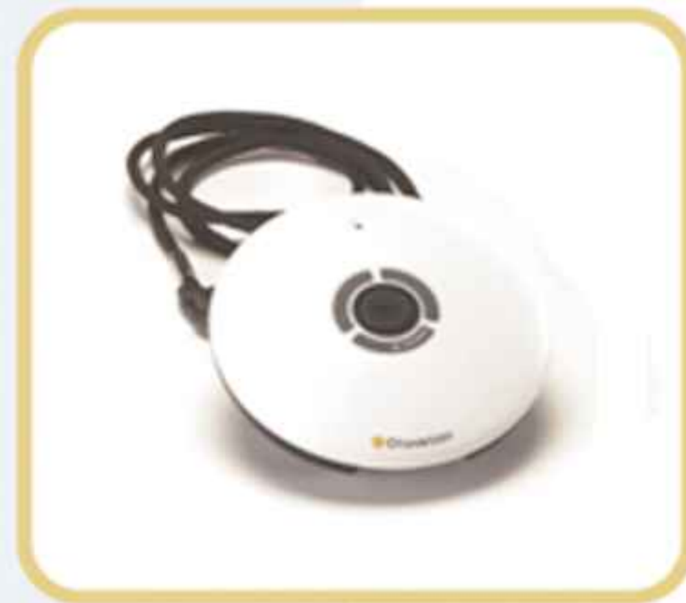
OTOPod ® Device